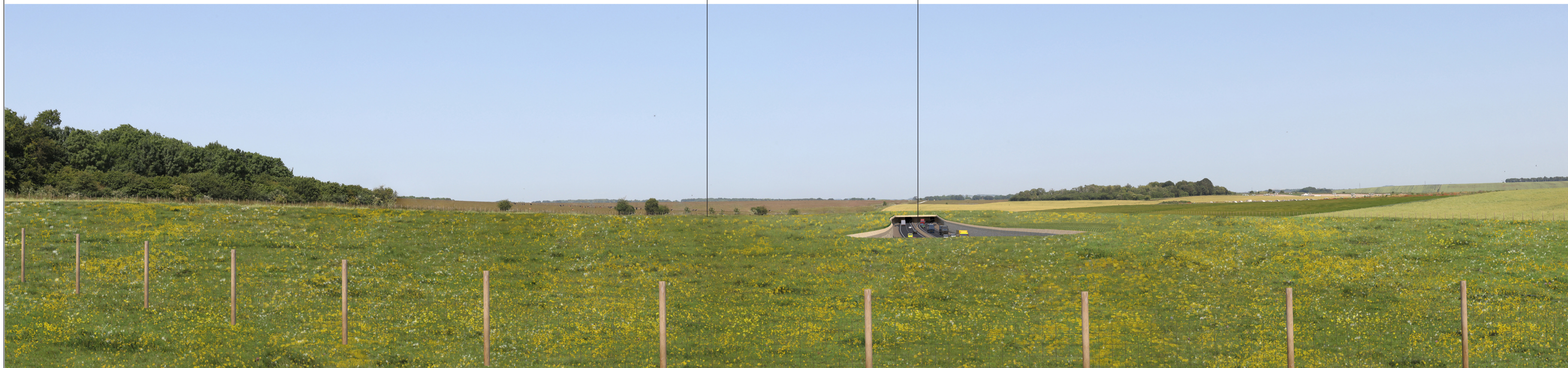
PROPOSED (SUMMER YEAR 15)